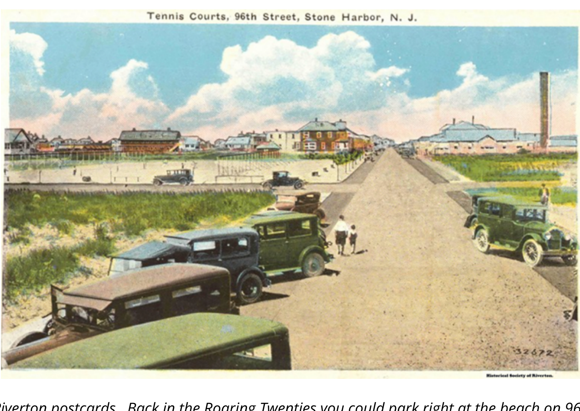
Riverton postcards. Back in the Roaring Twenties you could park right at the beach on 96 th Street with no parking meters.

Each month we bring you a memory from the past, courtesy of the Stone Harbor Museum.