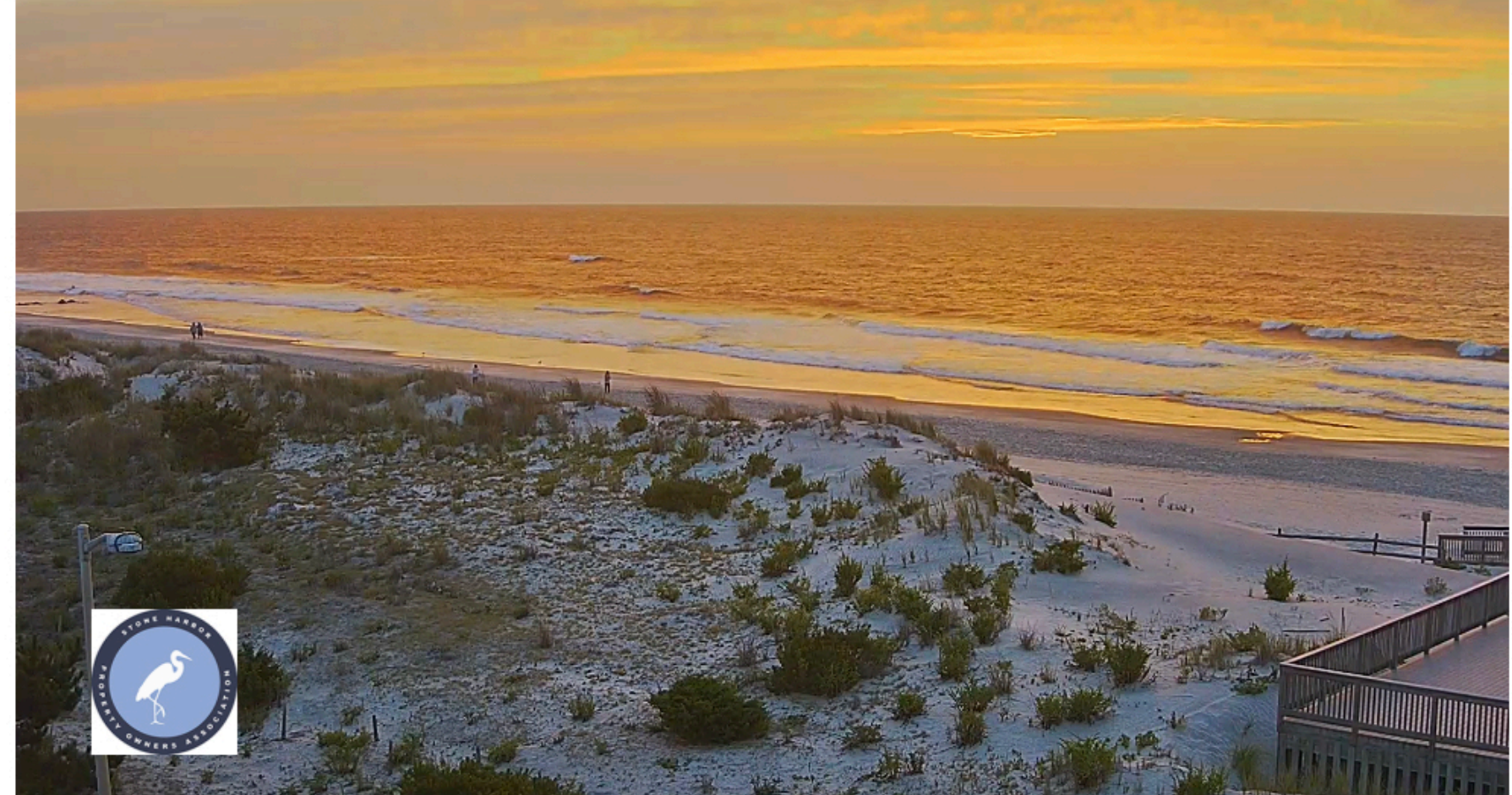
Good morning Stone Harbor! Now you can view the sunrise each morning even if you are not in town on the new SHPOA Beach Cam at https://www.stoneharborpoa.org/gallery/stone-harbor-beach-cam-and-weather-station/ . We also post often on our Instagram account (shpoanj), so do follow us.

Each month we bring you a recent photo of interest from around Stone Harbor.